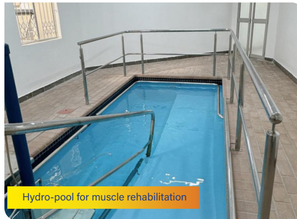
Hydro-pool for muscle rehabilitation

We are licensed private health facility, that meets all the requirements and regulations of Department of Health; in addition we are registered with the Board of Healthcare funders ( BHF ). We are contracted to all medical aids. Cash patients are also welcomed.