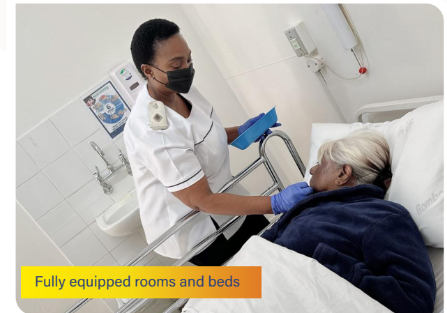
Fully equipped rooms and beds